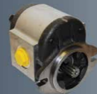
Hydrostatic Charge Pump