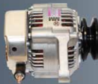
Alternator 4Y Engine