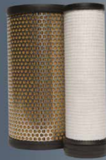
Toyota Outer Air Filter