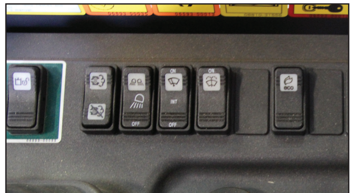
Multi-Function Switch Bank