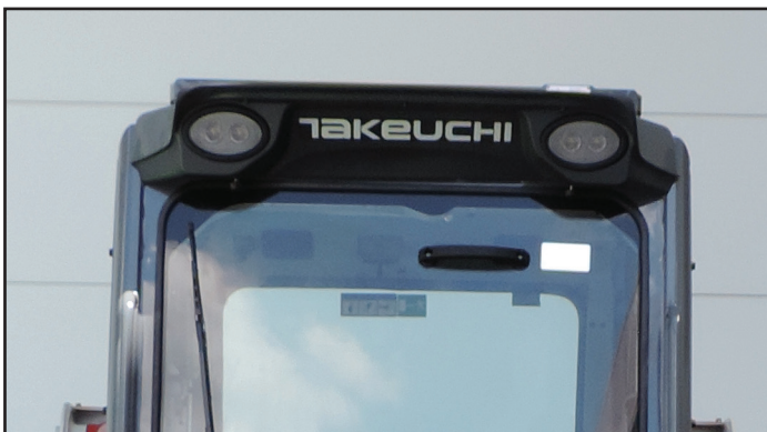
Roll Up Door