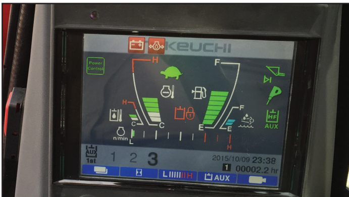
5.7" Color Display