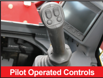
Pilot Operated Controls