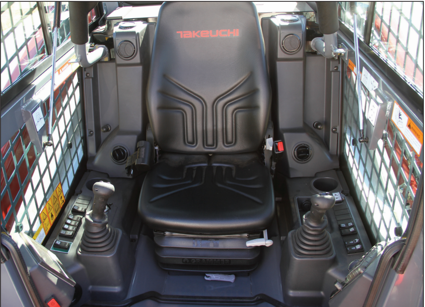
Spacious operator's station with easy to reach controls and switches.

An updated undercarriage with a wide block quiet ride track system provides better flotation, improved ride quality, and a reduction in noise and vibration. A powerful, 81.8 kW engine meets the latest EU Stage V / EPA Tier 4 emissions standards while delivering outstanding power and torque for impressive performance in the most demanding applications