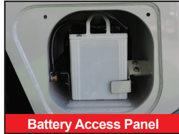
Battery Access Panel