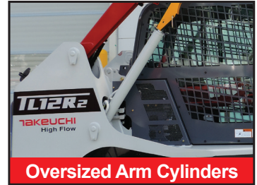
Oversized Arm Cylinders

The TL12R-2 features a radial arm loader arrangement, and demonstrates Takeuchi's continued commitment to product improvement and innovation. It features a completely redesigned operator's station with a 5.7" color multi-information display excellent feature set, and updated rocker switches that control a wide range of machine functions.