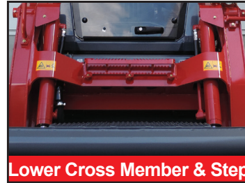
Lower Cross Member & Step