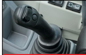
Hydraulic Joystick Controls