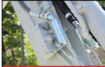
Multiple Service Ports (Up to 4)