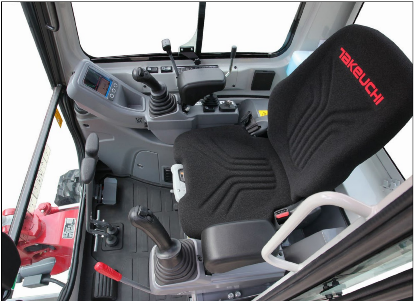
Spacious Automotive Styled Interior with Intuitive Operator Controls

The TB320 is a conventional tail swing excavator making it a very stable platform that provides excellent lift capacity. It is also available with up to four auxiliary circuits making it easy to add hydraulically driven attachments. The primary auxiliary circuit features best in class auxiliary flow of up to 40 L/min and it is controlled using a proportional slider switch located on the left joystick allowing the operator to meter flow to the attachment.