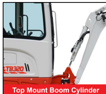
Top Mount Boom Cylinder