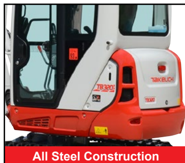
All Steel Construction