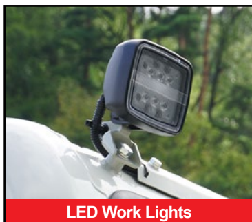
LED Work Lights