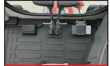
Large Floor with Foot Rest

Designed to work in confined and demanding applications, the Takeuchi TB320 features many advancements in performance and technology that make it an extremely versatile and productive machine. It is easy to transport and well suited for working in a wide range of applications from urban construction sites to areas with limited access such as around businesses, apartments, and homes. A key feature of the TB320 is the hydraulically controlled, variable width undercarriage that can retract to 980 mm and expand to 1370 mm wide. With the undercarriage fully retracted, the machine is able to maneuver easily through narrow passages to get to the work site. Once on-site, the undercarriage can be expanded to provide optimum balance and stabilization.