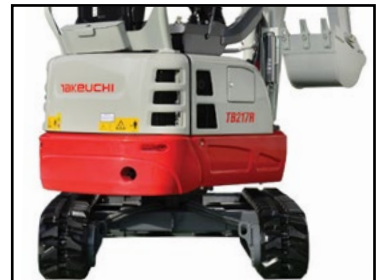
Short Tail Swing