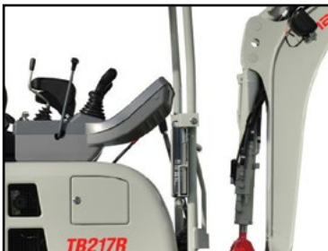
Top Mount Boom Cylinder