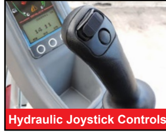
Hydraulic Joystick Controls