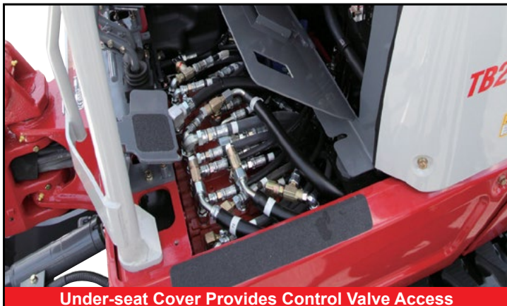
Under-seat Cover Provides Control Valve Access