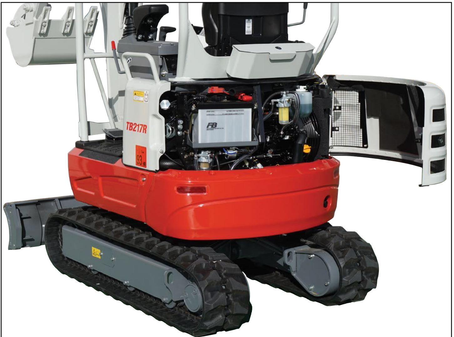
Easy Maintenance and Service Access

The TB217R is powerful, tough and versatile. This machine provides exceptional value and demonstrates outstanding performance.