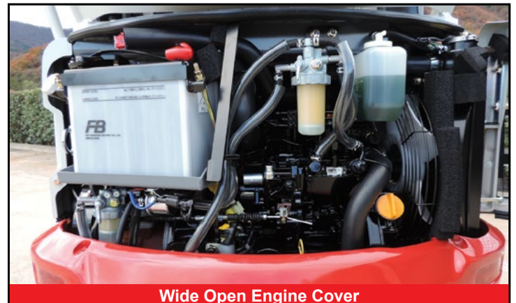
Wide Open Engine Cover

*Functions may not be available in all countries, so please consult your Takeuchi dealer for details.