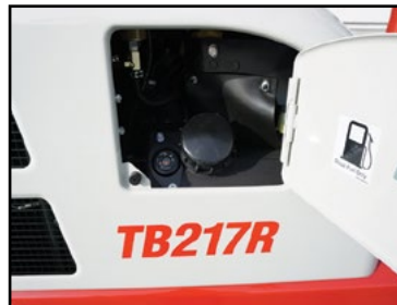
High Capacity Fuel Tank