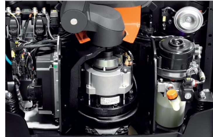
Easy access for efficient servicing