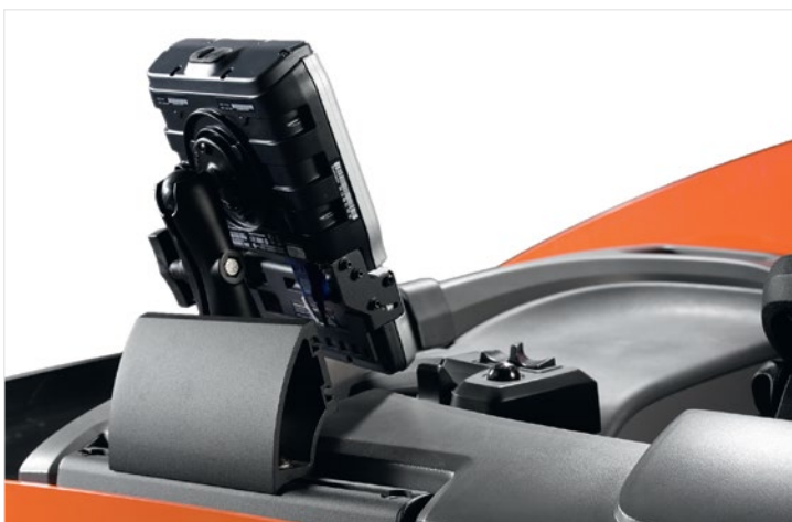
Optional E-bar for ancillary equipment