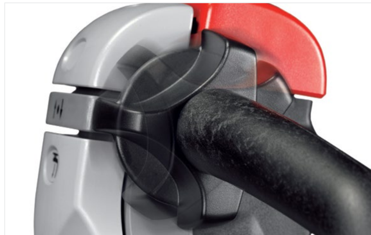
Fingertip control for drive, lift and lower with unique click-2-creep feature