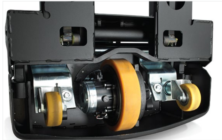
The unique Castorlink system protects castor wheels on uneven surfaces