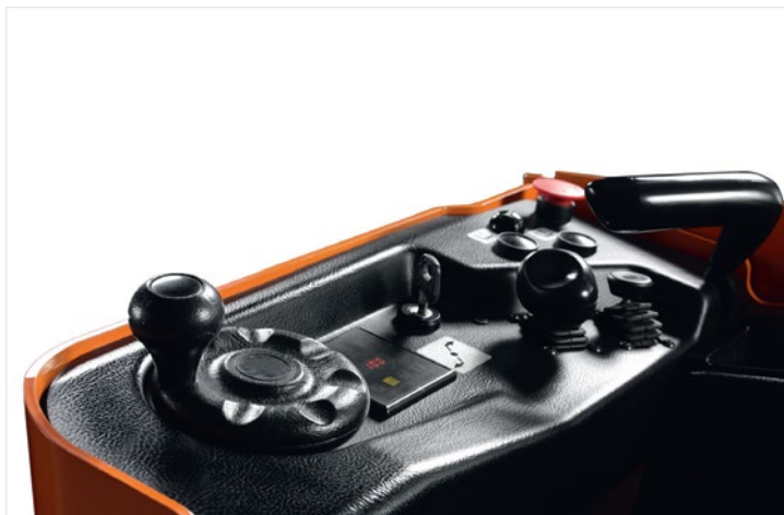
Easy driving with small electronic steering wheel