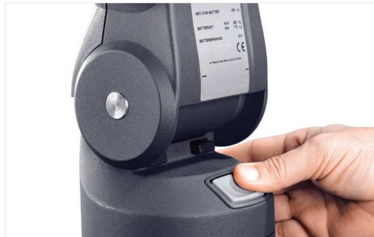
One-touch action to fold away the sideguards