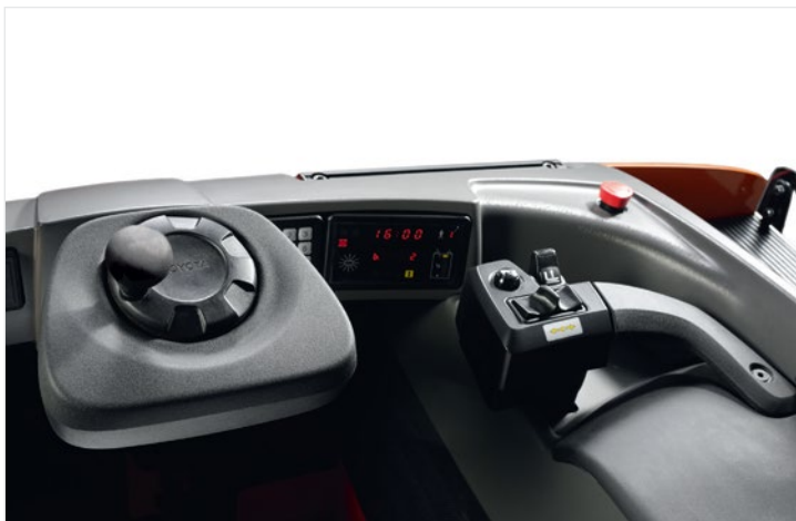
The cab and controls are fully adjustable to suit the driver