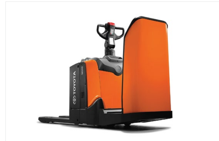
Fixed platform and backrest