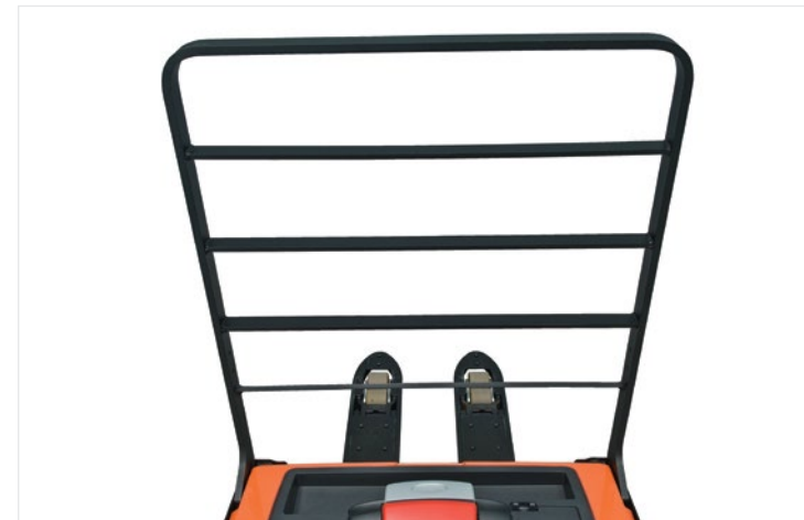
LWE load support