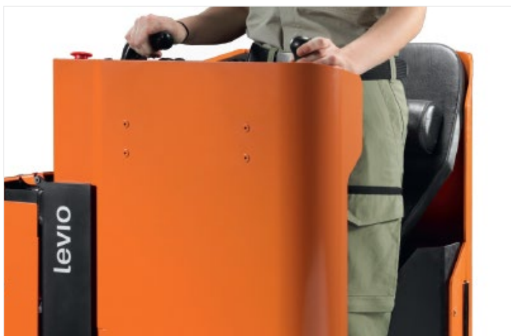
The driver is fully protected within the cab