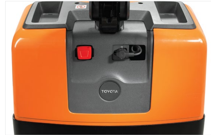
The control panel includes a pull-out power lead for the built-in battery charger