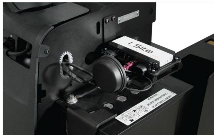
Easy access for efficient servicing