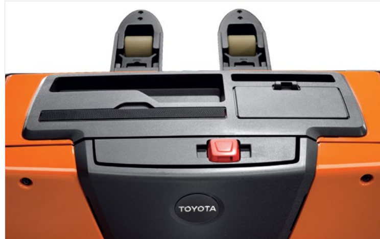
A clear and safe view of the forks