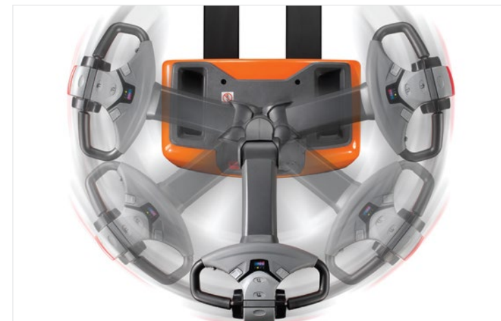
Steering arm rotation