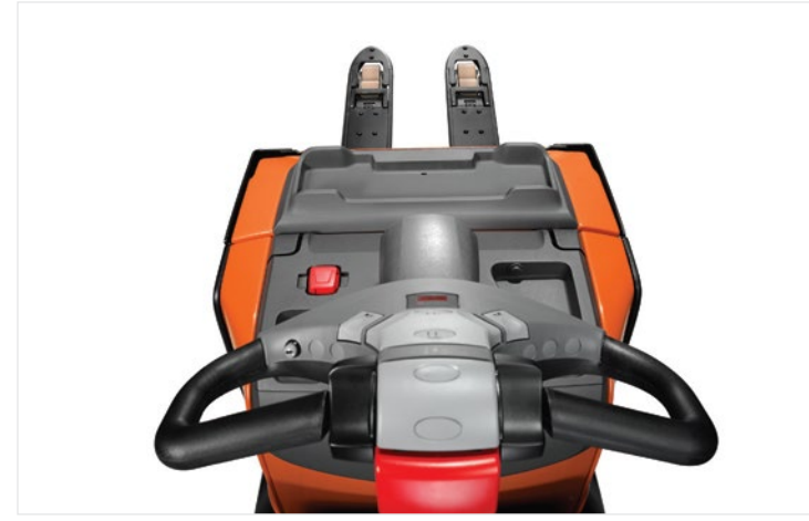
A clear view of the forks from the driving position