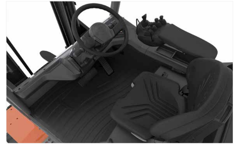
The spacious full floating driver compartment with minimal vibration and low noise offers the driver a comfortable work space.