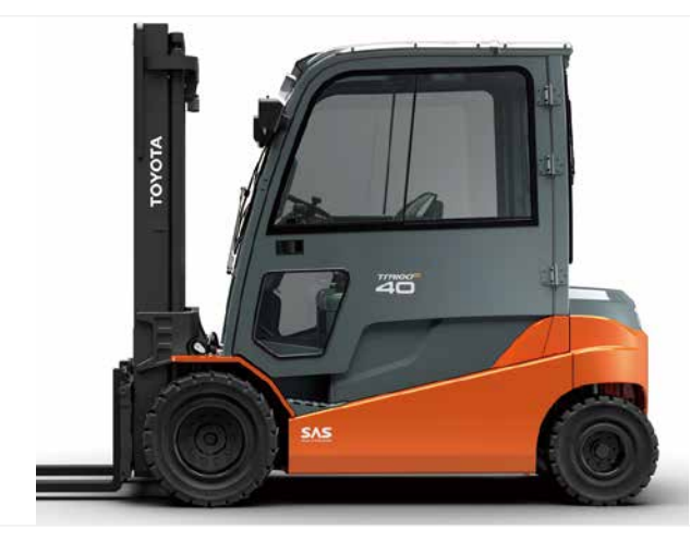
Cabin options provide weather protection, increased comfort and enhanced safety.