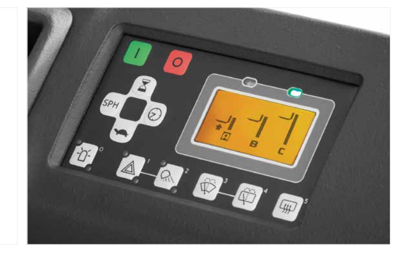
Lift height presetting saves time and effort for the driver.