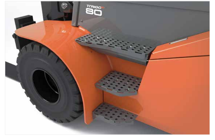
Large entry window with wide steps and double driver assist grips ensure fatigue is minimised in applications that require repeatedly getting in and out.