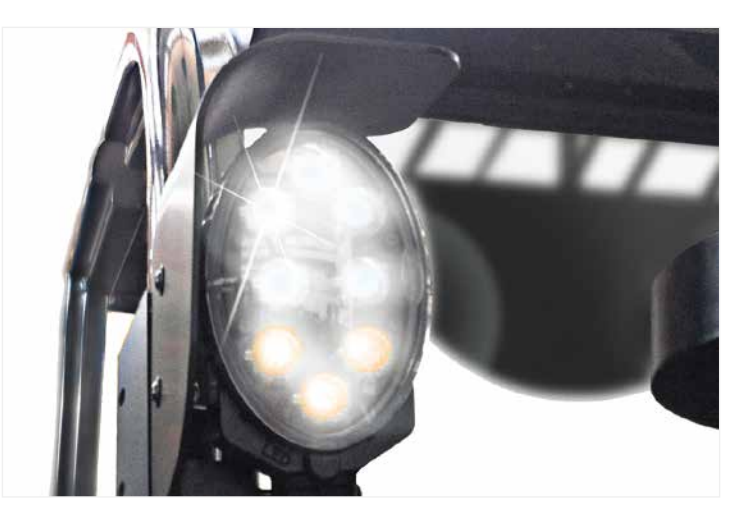
Powerful and efficient LED working lights allow work to continue in unlit areas or at night.