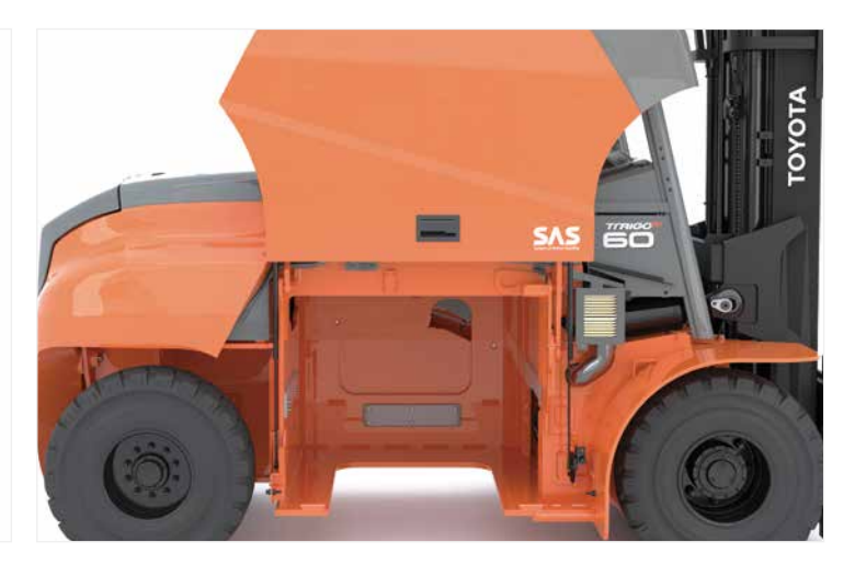
Open chassis design with side panel facilitates lateral battery exchange.