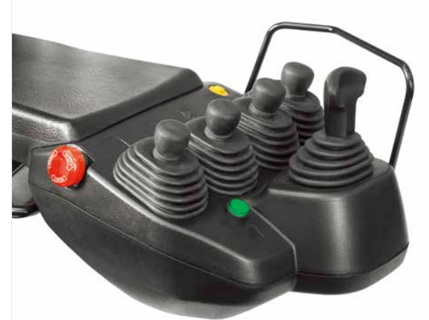
Minilevers in the armrest are intuitive and easy to use.