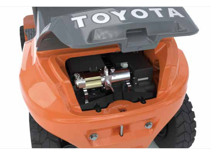
Easy access to main service components.